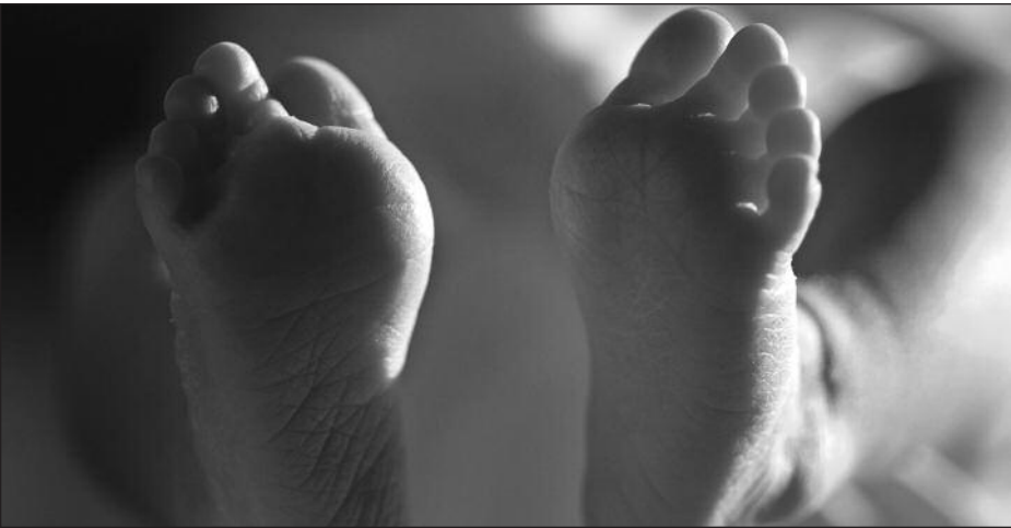
April is National Child Abuse Prevention Month.

"Be prepared for the process to take work," she says. "If you're lukewarm about it, you may not get results. If you are a mandated reporter, CPS will send you notification of the outcome of your referral."