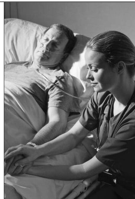
Education is an important factor in helping nurses provide spiritual care to their patients, according to Dr. Mamier's research.

Dr. Mamier's final model for predicting spiritual care practice frequency included four different independent variables. The strongest correlate was a measure that had not been used in previous research—nurses' perception that spiritual issues come up frequently on their unit.