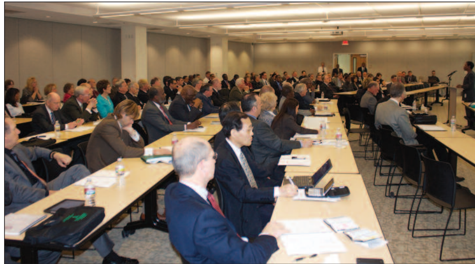
Approximately 130 leaders of the various LLU entities and the Seventh-day Adventist Church attended the corporate membership meeting.

For 35 years, the university has run academic programs overseas to train students in many nations who then go on to help their fellow countrymen receive proper care. Additionally, LLU Medical Center clinicians serve as mentors to raise the skill level of visiting health care professionals from other countries. In 2010, for example, 78 professionals from 15 countries