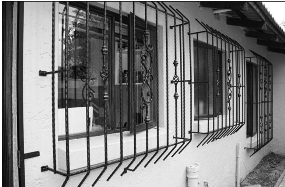
A needs assessment study of a San Bernardino Housing Authority neighborhood showed that many residents don't even know their neighbors because they are afraid to leave their homes. The study was conducted by faculty and students in the department of counseling and family sciences, part of the LLU School of Science and Technology.

"Our study was primarily interested in looking at interactions between the community resi-