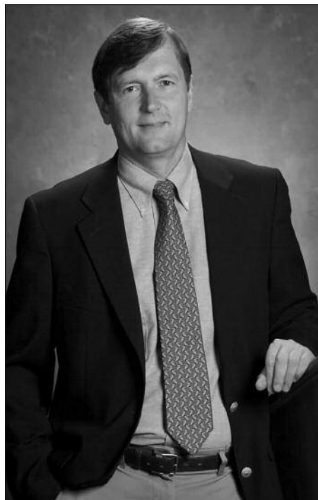
Edward Larson, PhD, JD