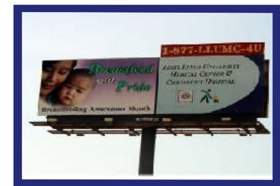
As a precursor to the campaign this billboard was displayed on "I-10" at Mountain View