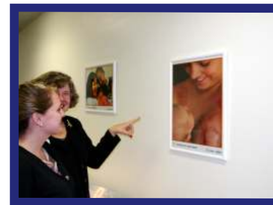
Participants at the Art Show/ Open House view the art work