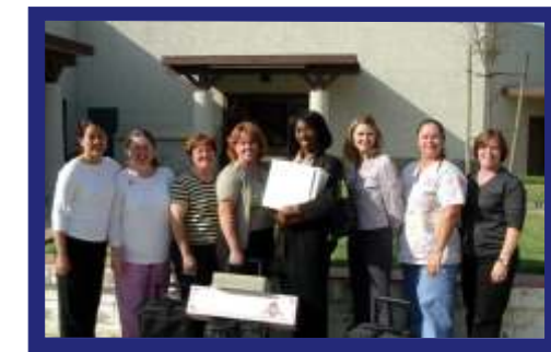
Train the Trainer participants and PSN staff after the September '03' class

Train the Trainer is an advanced training course for qualified Network Hospital staff. The training prepares participants to begin the process of becoming a Birth and Beyond trainer. Each hospital is supplied with training materials that include videos, books, and other materials to share with their staff. If you are interested in becoming a Birth and Beyond trainer for your institution contact the program manager at your agency for application information.