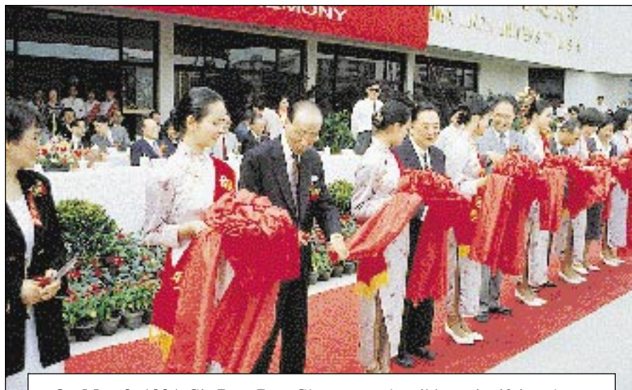
On May 9, 1994, Sir Run Run Shaw cuts the ribbon signifying the official opening of the new hospital he was instrumental in developing. Sir Run Run Shaw Hospital is located in Hangzhou, People's Republic of China, and is operated by Loma Linda University and Medical Center, and the General Conference of Seventh-day Adventists.