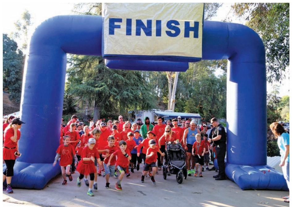
Runners bolt out of the starting gate at the 2nd annual Family Fitness Fun 5k and Expo, which was held Sunday morning, April 3, at the historic Burrage Mansion in Redlands. Sponsored by the Big Hearts for Little Hearts Loma Linda Guild, the event attracted 40 percent more runners this year than last.