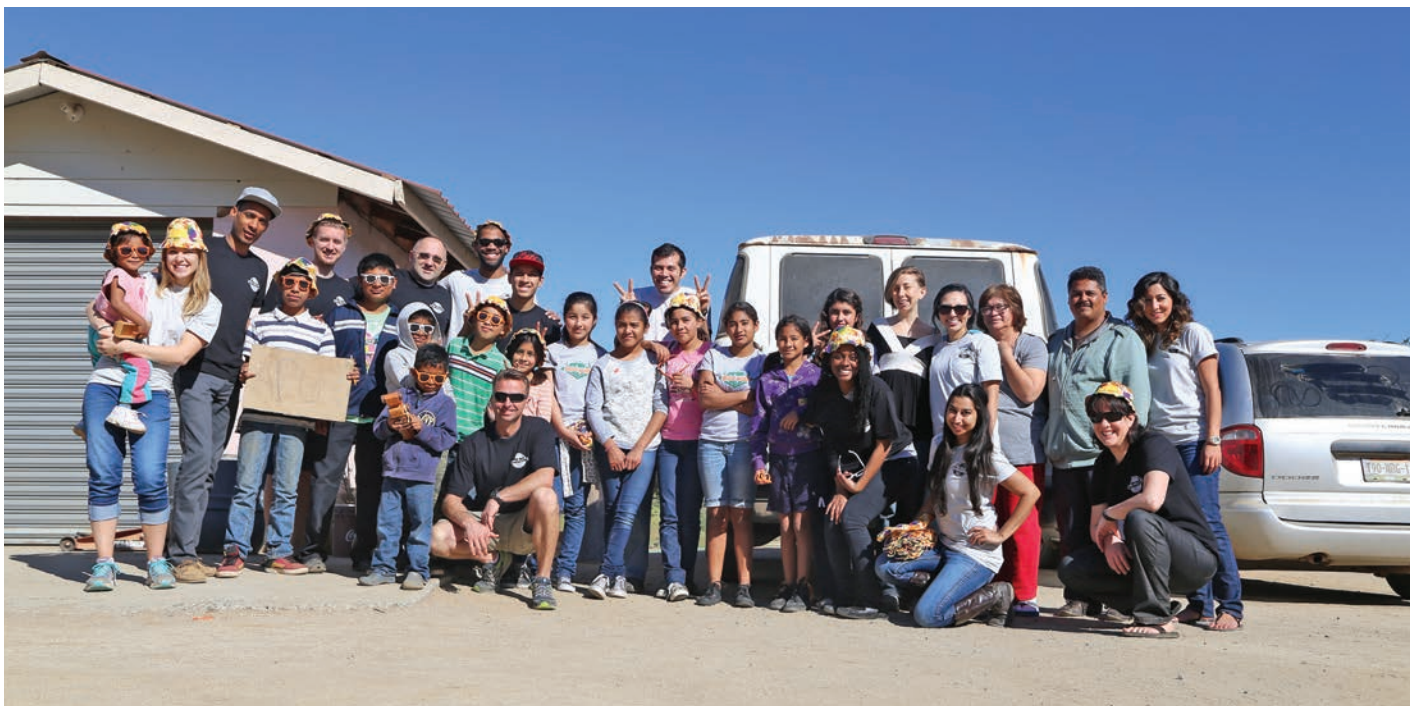
Mexico mission trip participants pose for one last picture with the local children before returning to Loma Linda.