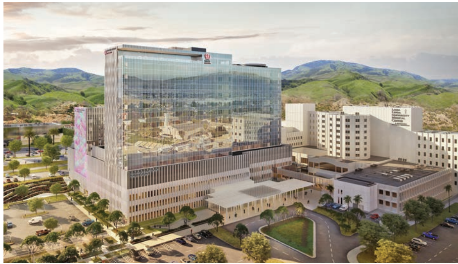
The groundbreaking on May 22 represents the beginning of a massive building project that will lead to the rendering above.

What will that future look like? The new medical complex will feature a 16-story adult hospital tower and