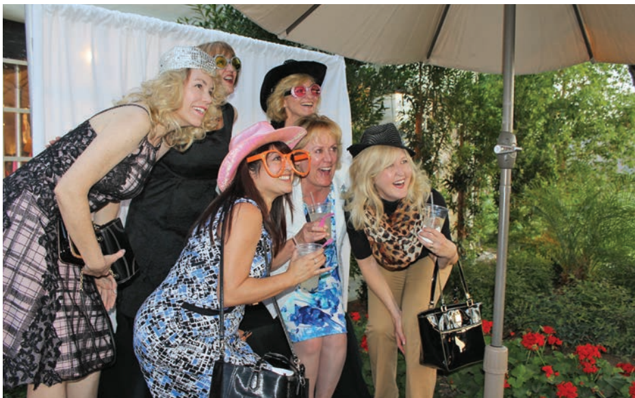
A group of ladies who attended "An Evening of Girlfriends, Glamour & Giving" March 15 took advantage of the complimentary photo booth. The ladies enjoyed using various props to animate their picture.

The Big Hearts for Little Hearts Desert Guild started in 2002 with a mission to raise funds to ensure critical medical care for the children of the Coachella Valley. Now, with over 120 members, the Desert Guild continues to do just that, having raised more than $1.7 million since its inception.