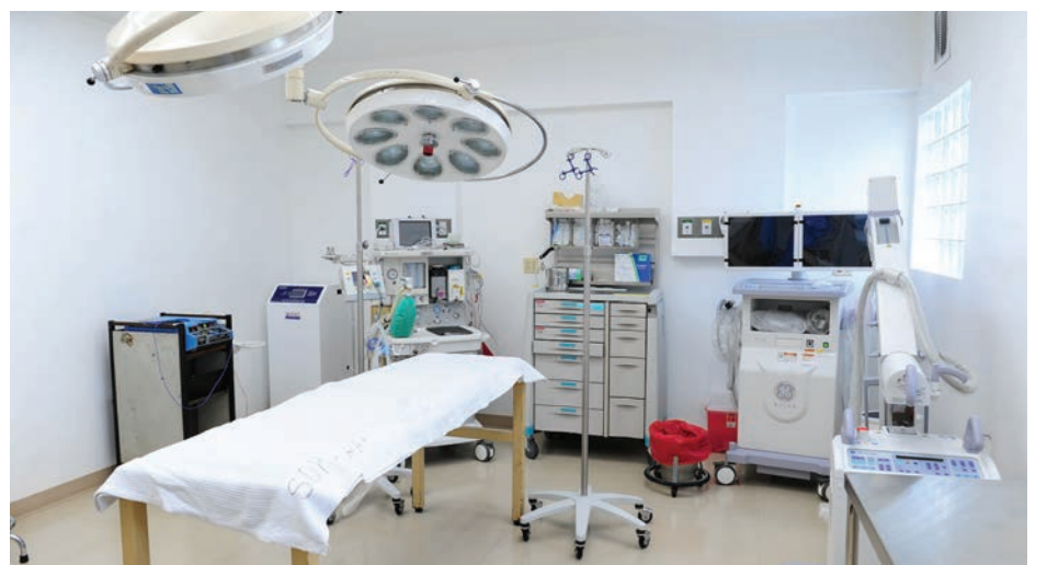
Three state-of-the-art operating rooms, including the one above, were celebrated by the ribbon-cutting.

“We want to be an institution that reflects God’s love and His compassion to all — patients, partners and visitors,” he said.