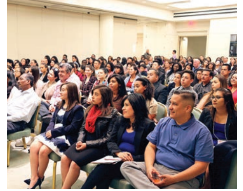
More than 200 people attended the Apprenticeship Bridge to College Invitational on March 29.