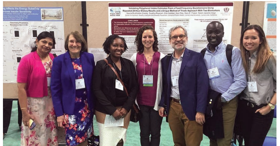
School of Public Health department of nutrition faculty and student researchers presented posters at the 2016 Experimental Biology Conference.

Twenty-two presentations were made at this conference. Nine nutrition doctoral students, three epidemiology students, two post-doctoral fellows, and seven faculty members from School of Public Health department of nutrition presented. Four student posters were selected for a competition in the session “Emerging Leaders in Nutrition.” Several LLUSPH doctoral students are recipients of the Selma Andrews Award for presentations at past EB conferences.