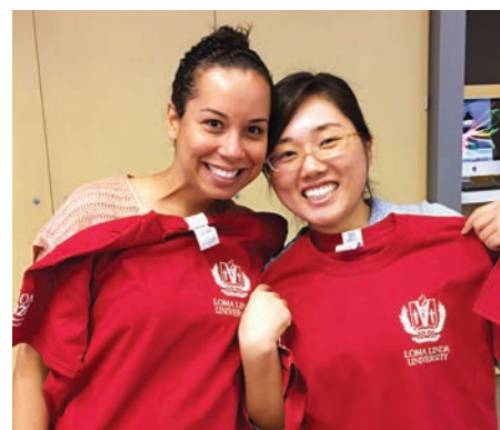
Two Loma Linda University Health students react with joy to the gift of a T-shirt celebrating Vision 2020 and the groundbreaking celebration for the new adult and children’s hospitals, which will take place on Sunday, May 22.