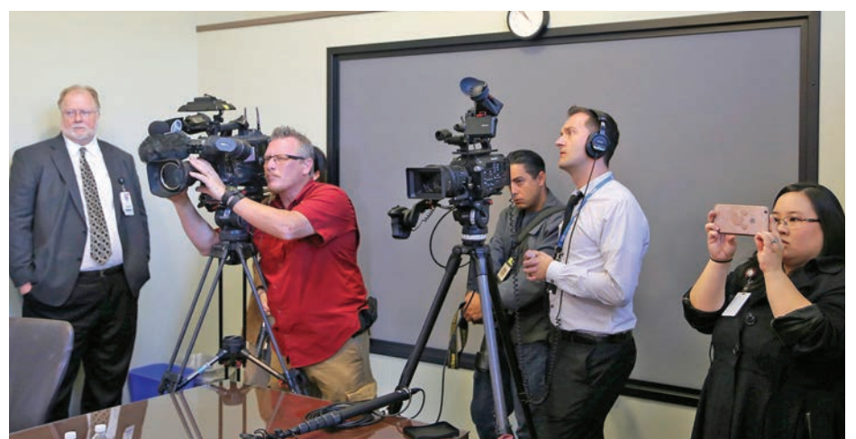
Cameras from ABC7 News, the San Bernardino Sun, the department of Advancement Films, and social media at Loma Linda University Health record the March 29 press conference to celebrate the fact that an NIH entity recently awarded a $6.29 million program project grant to the Center for Perinatal Biology at Loma Linda University School of Medicine.