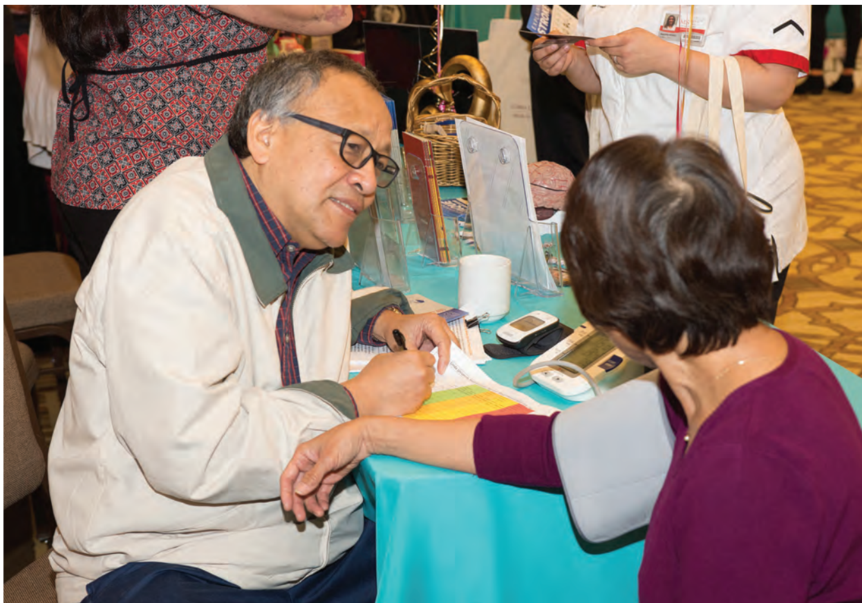
Free blood pressure screenings were available during the Second Annual Heart Health conference. Attendees were encouraged to monitor their blood pressure as part of a daily routine.

For more information on LLUMC – Murrieta's cardiovascular services, visit murrieta.lomalinda-health.org/our-services/heart-care .