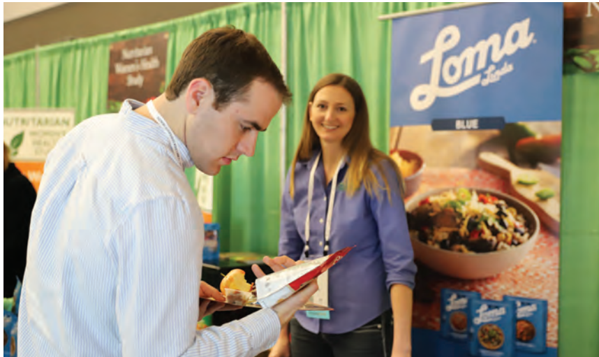
Those attending the Congress learned about a wide range of products designed to help people make the transition to vegetarian diets.

Visit http://www.vegetariancongress.org for updates regarding the next congress scheduled for 2023.