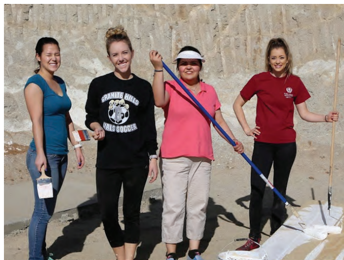
Eight students from the Schools of Pharmacy and Dentistry spent winter break on a mission trip to the Mount of Olives Children's Village in Baja California, Mexico. The group held a health fair, served children at the orphanage, and provided labor to repair things around the property.