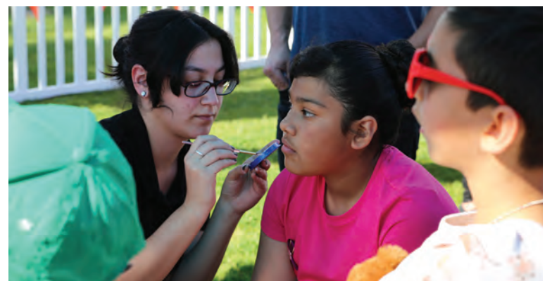
An All About Kids Health Expo followed the ribbon cutting ceremony. More than 1,000 community members enjoyed fun healthy activities designed for the entire family.