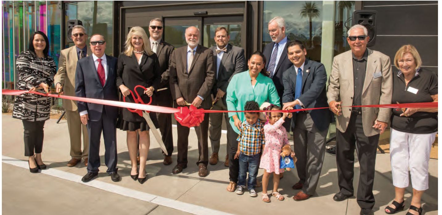
The grand opening of Loma Linda University Children's Health – Indio, Jill and Barry Golden Pavilion, featured a ribbon-cutting ceremony. Many community members attended the event held March 11.

To make an appointment or for more information about LLUCH – Indio, call 760-477-0733 or visit them on the web at lomalindakids.org/indio.