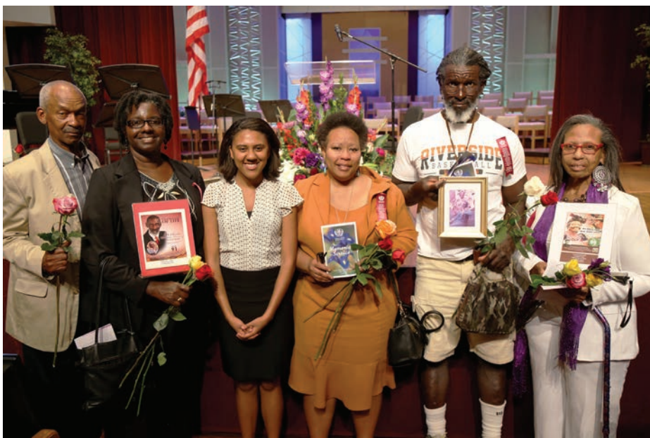
A Loma Linda University student (third from left) joined members of a family as they celebrated the memories of their loved ones.