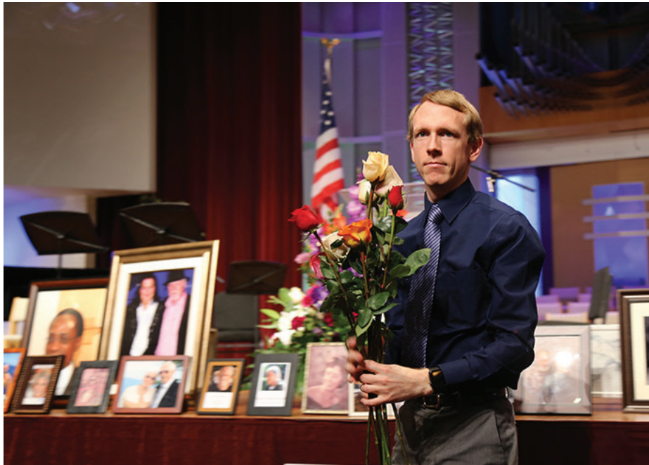
Students gave roses to family members of people who donated their bodies so others could learn.