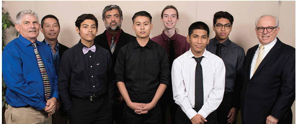
Students recognized at the el-MSOP Capstone event honoring the first group of Indian Springs High School participants with their instructor and faculty from Loma Linda University School of Allied Health Professions.