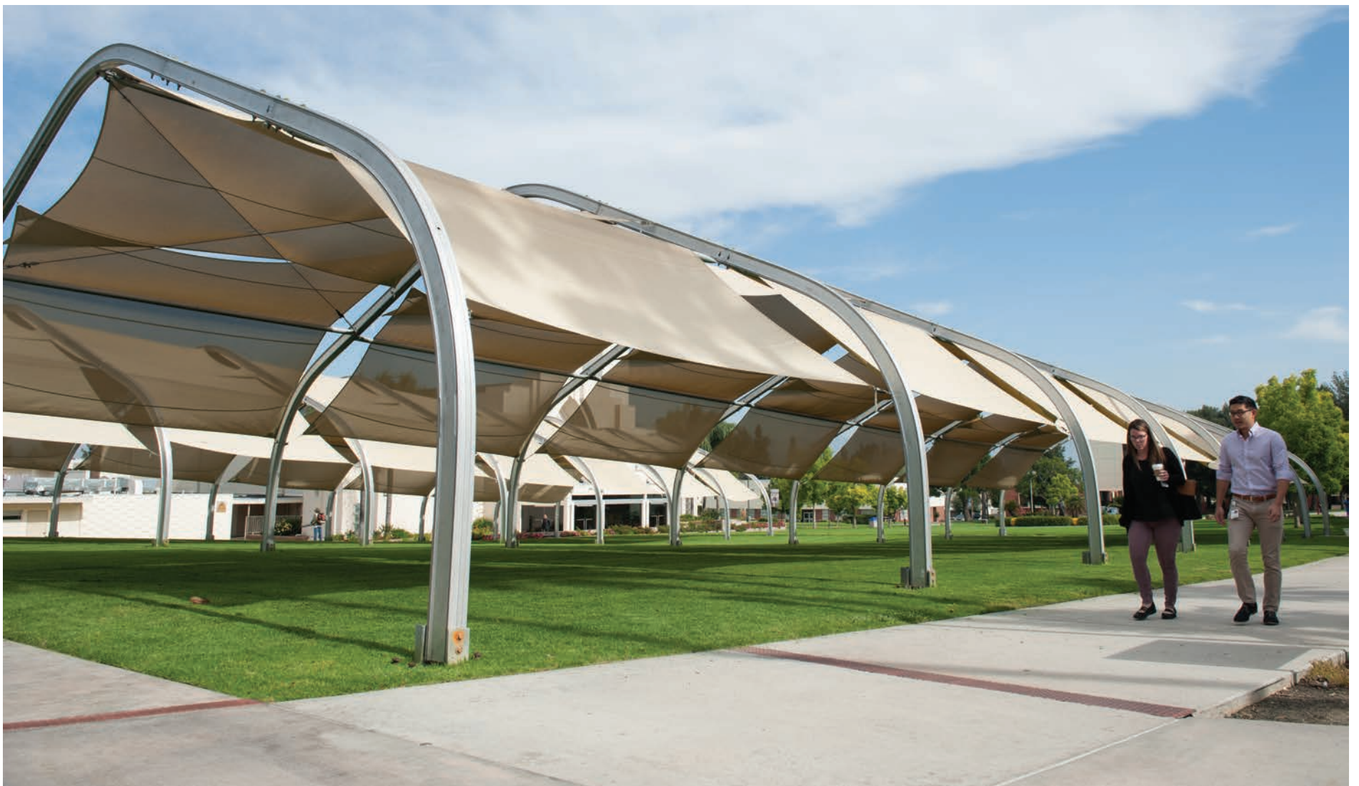
Loma Linda University’s Schools of Medicine, Pharmacy and Dentistry will kick off the commencement season when they hold their celebrations on May 28, on the Campus Mall.