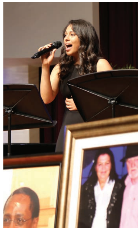
Students shared songs and testimonies about the deceased.