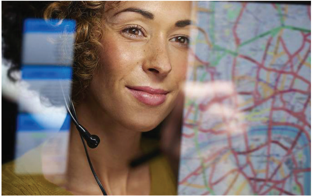
Sophisticated GIS technology opens up a world of possibilities for public health professionals.