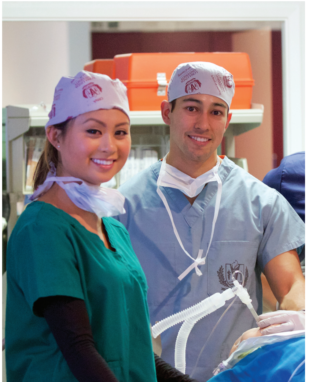
The School of Nursing has launched a Doctorate of Nursing Practice (DNP) degree program designed to educate bachelors-prepared critical care registered nurses in the advanced practice nurse anesthetist role.

For more information, call 909-558-4923 or visit https://nursing.llu.edu/graduate-programs/bs-dnp .