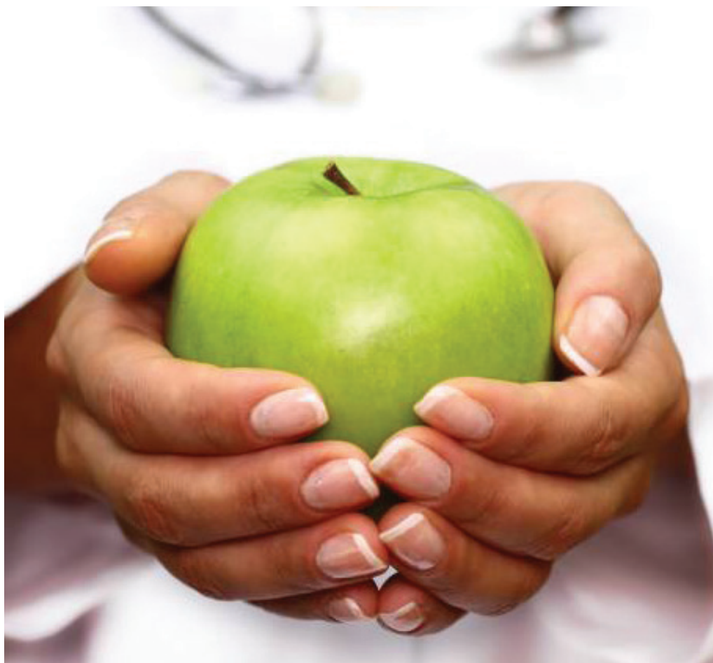
Loma Linda University Health's new PhD degree in nutrition will be the only program of its kind in Southern California.

The school has hosted the International Congress on Vegetarian Nutrition for the last 35 years. Also, the school is part of a health sciences university that includes seven other schools and provides numerous opportunities for