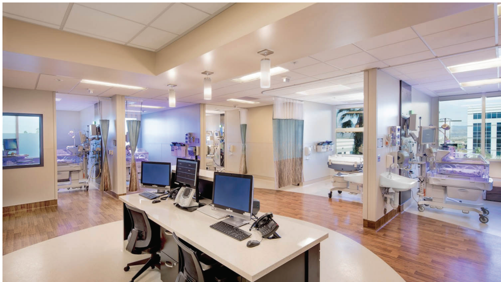
Loma Linda University Medical Center – Murrieta on Jan. 17 opened its doors to a new NICU, the first of its kind to the Murrieta community. The Level II NICU offers six private rooms designed for families to stay overnight with their newborns.