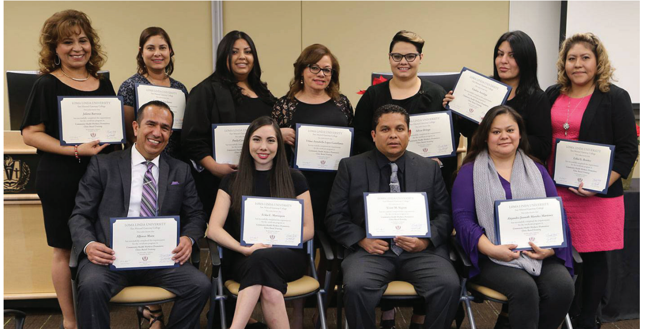
Fourteen graduates of the clinic-based community health worker program at Loma Linda University Health San Manuel Gateway College Promotores Academy celebrated the completion of their program in mid-December.